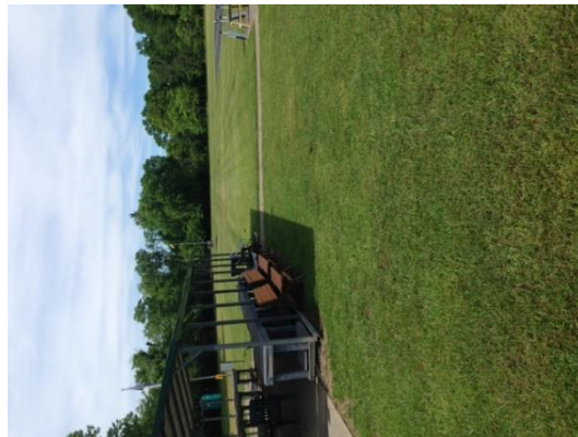
A view looking north at the shelter and the new benches provided by Charlie Hopson

https://www.youtube.com/results?search_query=loverc