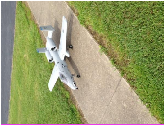
"Warthog" returning from a mission!